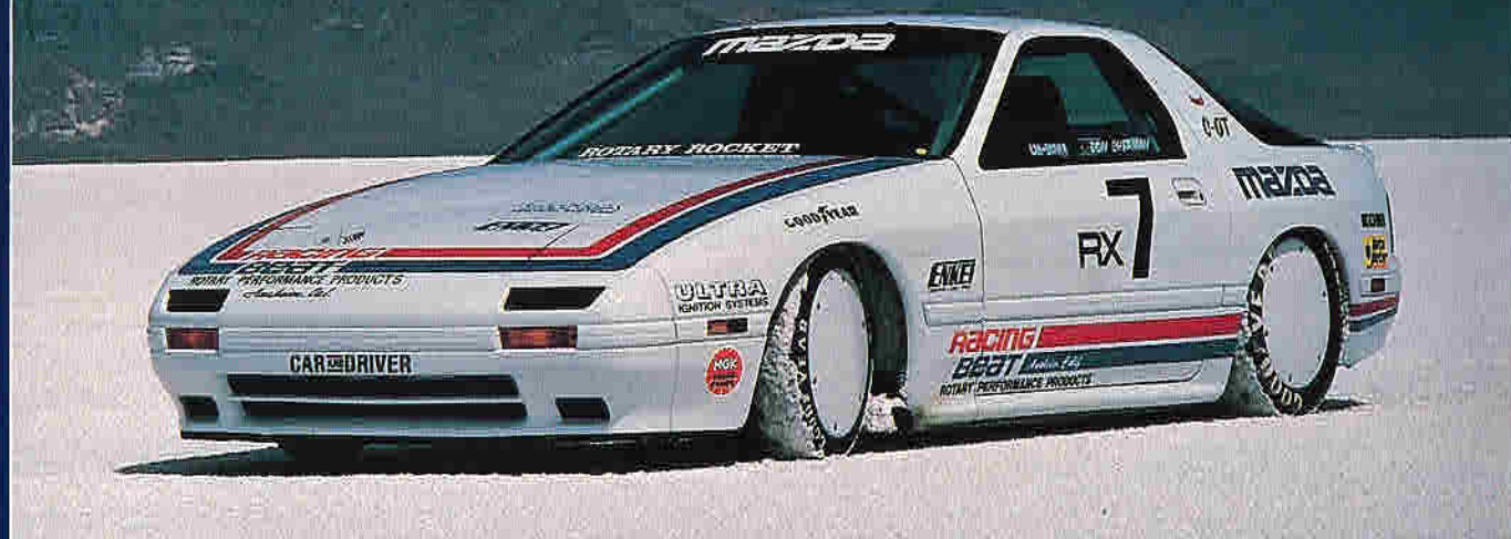
Racing Beat prepped turbo '86 RX-7 set C/GT class record of over 238 mph at Bonneville Salt Flats.