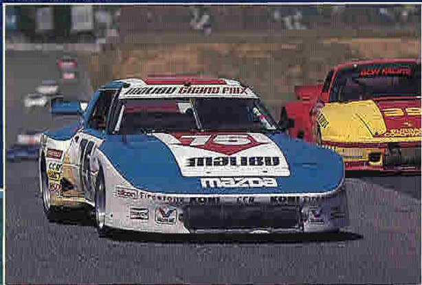
Clayton Cunningham Racing GTU RX-7 in traffic.